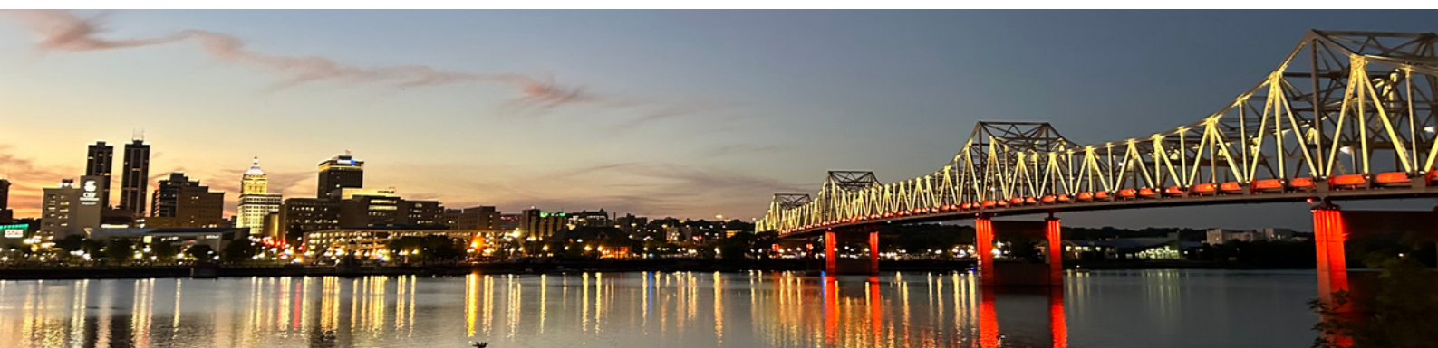
Bridge Illuminated Orange for Hunger on September 1st - Thanks to Peoria Area Food Bank & Midwest Food Bank

Find the full list of events & education for Hunger Action Month at: go.illinois.edu/HAM2023