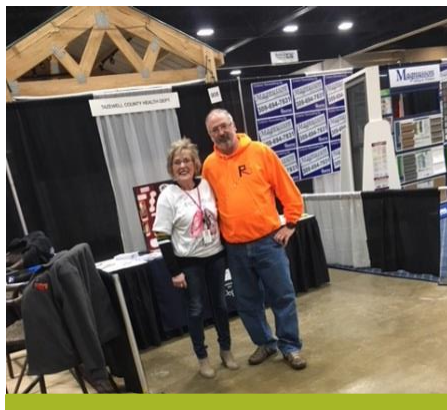
Working at the Central Illinois Home Show to raise the level of knowledge of Radon in our Community

The Partnership Board has been forming over the 2017 year. Major accomplishments for the board include: establishing the health priority committee structure, reworking the Partnership website, collaborating with local universities and colleges to establish the